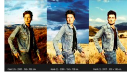
© Risk Hazekamp, The Giant Series, 2001, 2009, 2017, analog colour photography between Dibond and acrylic glass