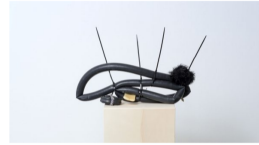
© Renate Hampke, Pneuma-tac 1, 2016, bicycle inner tubes, cable tie, soap and faux fur