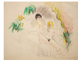
© Lene Schneider-Kainer, Aktzeichnung, 1919, watercolour, ink, on paper