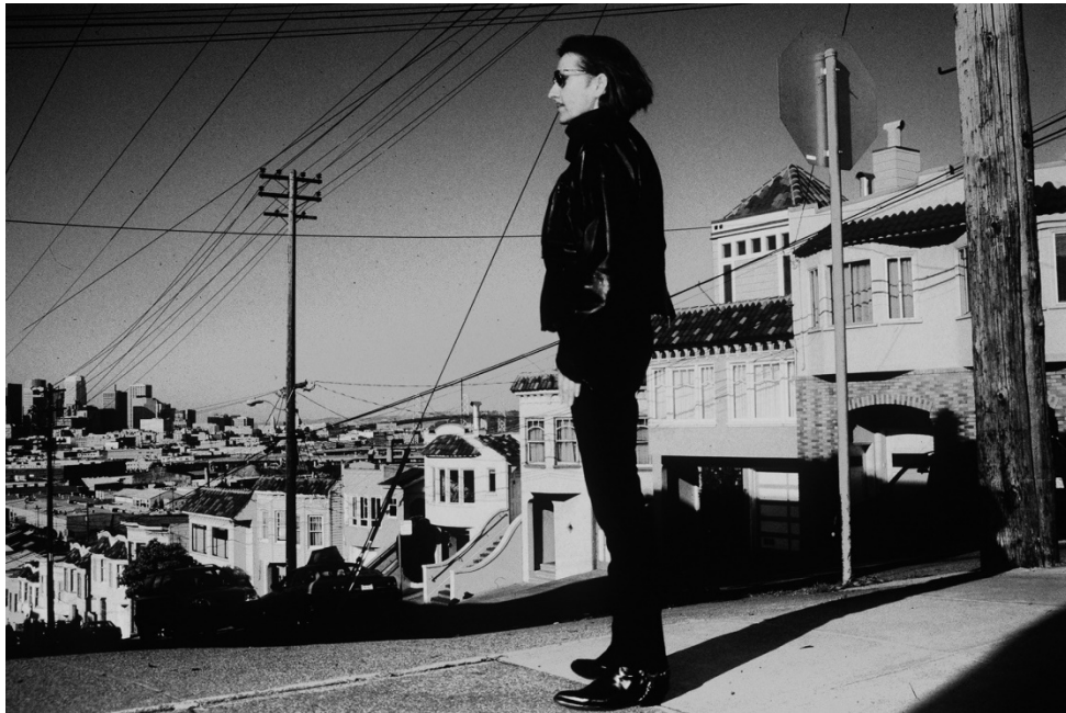
Gendernauts , 1999

In the 6th program of the 12 Moons , we show a selection of documentary films from Monika Treut's extensive work . We will focus on her passion for strong and resistant characters and meet individualists who create their own versions of feminism, who pursue their sexual and physical self-determination with willpower and who are utterly committed to their values and beliefs.