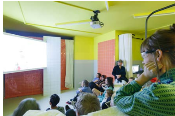
12 Moons Film Lounge